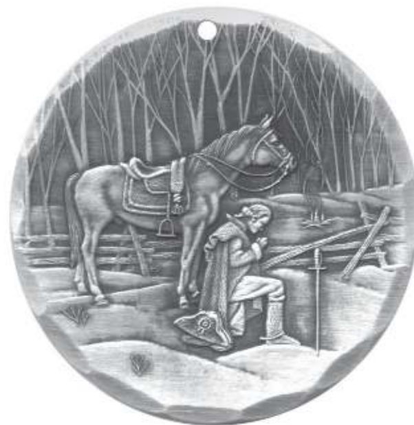
Prayer at Valley Forge Ornament: Free "Prayer at Valley Forge" ornament for active members of the Armed Forces serving abroad. Shipping included. No purchase necessary.