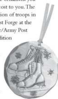
2008 Annual Ornament, "Skates for Christmas" Celebrating its 29th Year of Issue

In the spirit of giving, we've created a special gift, a commemorative ornament you can send to your loved one serving in the Armed Forces — at no cost to you. The ornament is called "Prayer at Valley Forge" and captures the emotion of troops in the field. To take advantage of this offer, simply visit Wendell August Forge at the Main Street at Exton. Give us your loved one's name and APO (Air/Army Post Office) or FPO (Fleet Post Office) address. We'll send the limited-edition ornament with an elegant gift card that provides space for your personalized message. Limited to one request per family or friend. No organizations please. Only 10,000 ornaments are available — so stop in today. To ensure the ornament arrives by Christmas, this offer is only valid from September 27 through October 11, 2008. And as the holidays approach, we are reminded that one of freedom's greatest gifts is prayer. Thanks to our partners in this effort, The Daily Local and The United Systems of Arkansas.