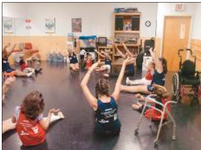
At left, coaches teach arm-dance moves at the camp.