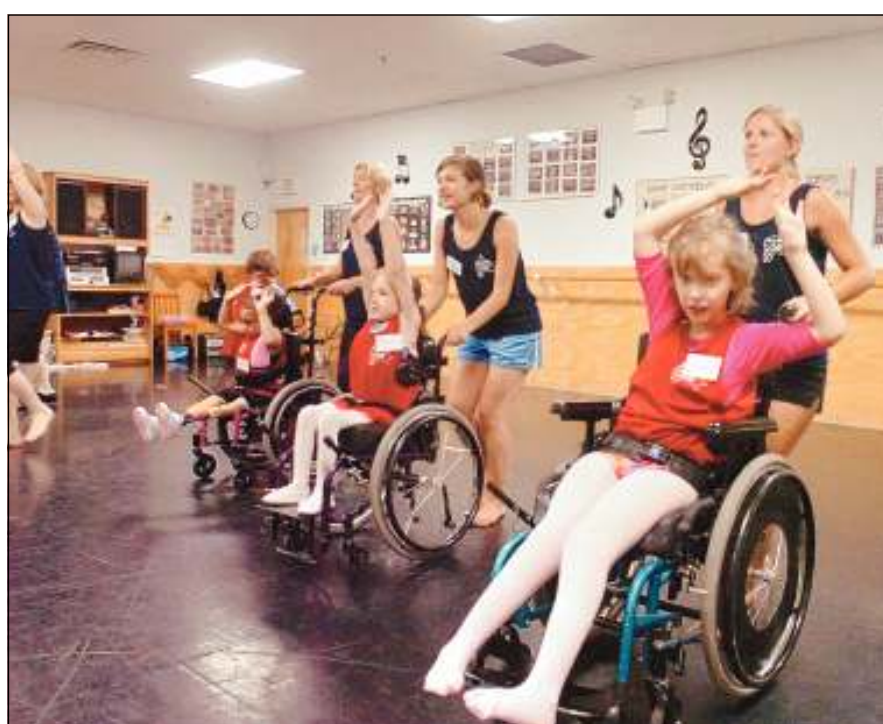
Above, coaches move the wheelchairs while the children perform dance moves at the Shining Stars Adapted Dance Camp.