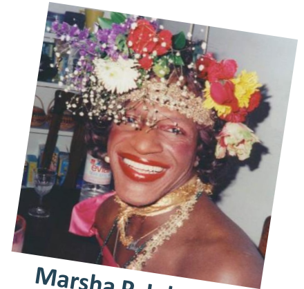
Marsha P. Johnson Gay liberation & AIDS activist

The word pride is used in this case as an antonym for shame.