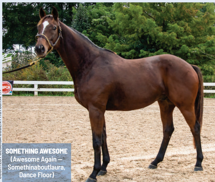
SOMETHING AWESOME (Awesome Again — Somethinaboutlaura, Dance Floor)