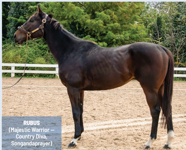
RUBUS (Majestic Warrior — Country Diva, Songandaprayer)