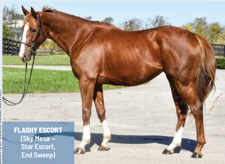
FLASHY ESCORT (Sky Mesa — Star Escort, End Sweep)

Rubus: This horse obviously needs to build a topline and put on weight and muscle but, from what we saw at the Master Class, he has a very easy personality and a quiet demeanor. His