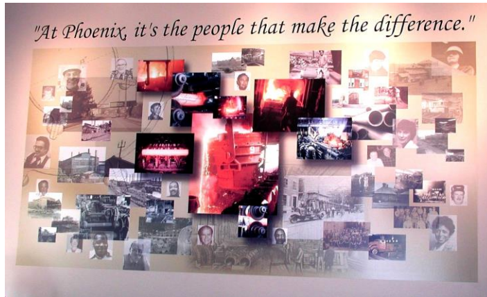
This is an image of the mural that pictures the employees at the Phoenix Iron and Steel Company.