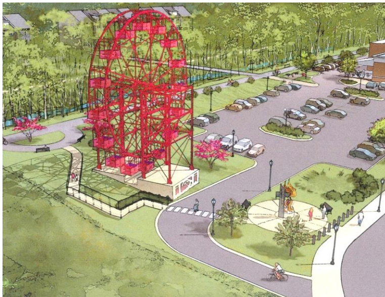
Here is the Borough engineer's preliminary rendering of the Phoenix Wheel placement

The Phoenix Wheel's presence as a sculpture will be an aesthetic, historic asset for everyone in the community. Combining this unique, historic piece from the past with recreational opportunities and a place to park a car will also provide positive economic development for the community. It will become the special feature that has a strong impact in a pragmatic gathering place by attracting visitors, trail users, and community residents as well.