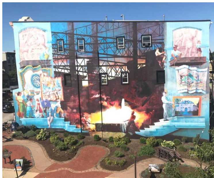
The new version of the Phoenixville Mural & Renaissance Park

Along with reinventing our interactive exhibits, the SRHC also accomplished another major achievement in the past two years. Our museum acquired the property at Bridge and Main Streets, in the center of Phoenixville's Downtown Historic District. In 2020 the Phoenixville Mural and the adjacent Renaissance Park were badly damaged by the fierce hurricane force winds. With widespread community support, the SRHC was able to reinvent the Phoenixville Mural using digital photographs of the original mural. It has been reinvented using a special poly-tab fabric that strongly adheres to the wall. It has also been varnished so it is protected and also will not fade. Many improvements were also made to Renaissance Park as well, including a new Gathering Place with new inscribed bricks and benches.