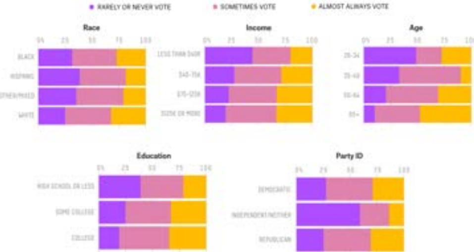
Those who almost always vote and those who sometimes vote aren't that different Demographic information of survey respondents, by voting history