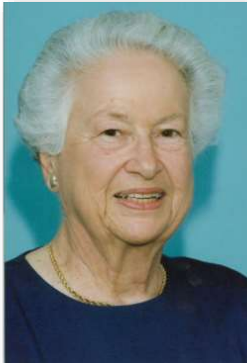
Board Chair, CCCF, 2004