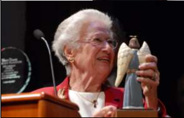
Chester County Community Foundation 2007 Jordan Award for Chester County Philanthropy Longstanding, Impactful, Widespread Generosity